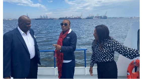
The Maryland Port Authority hosts leaders from the Port Authority of Jamaica. A Sister Port agreement between Maryland and Jamaica is expected in 2024. June 2023.