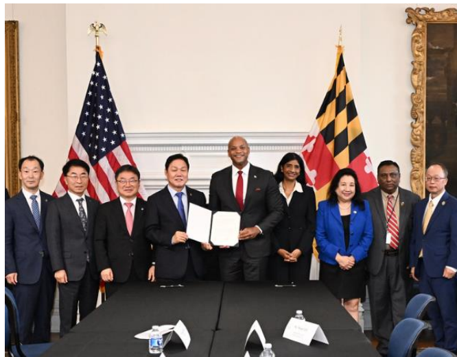
Governor Wes Moore and Governor Wan Soo Park sign an MOU to expand the Maryland-Gyeongnam Sister State relationship to include the areas of aerospace and space science. October 2023.